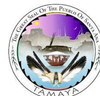
Pueblo of Santa Ana