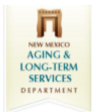
NM Aging & Long Term Services Dept